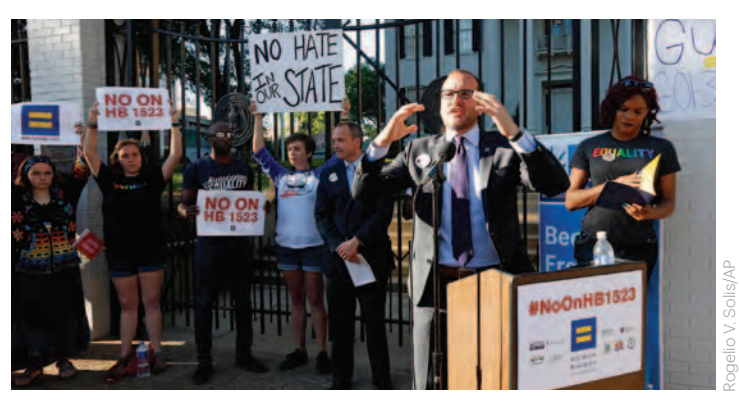
MISSISSIPPI REBELS: Human Rights Campaign president Chad Griffin protests state law.

According to information compiled by the Human Rights Campaign, a group that advocates for LGBT protections, some 28 states have no anti-discrimination protections for gays